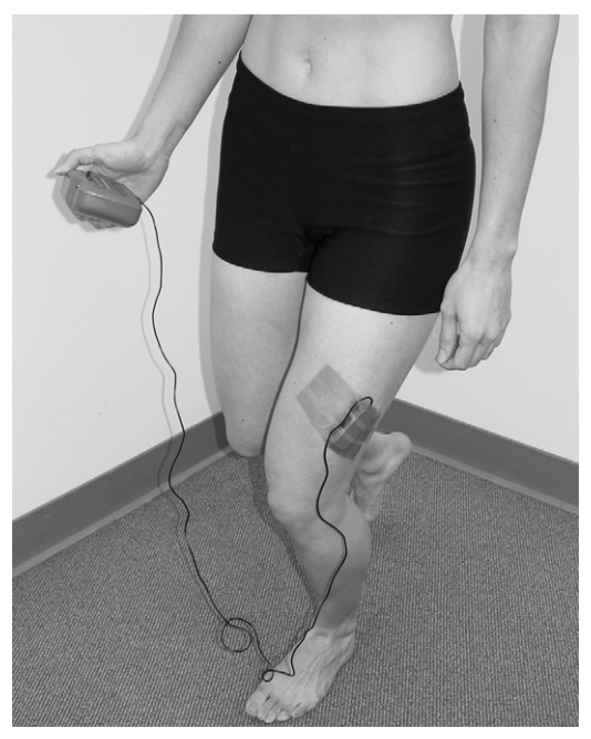
Fig. 2. EMG biofeedback can be used to facilitate quadriceps recruitment during functional tasks. ( Reproduced from Powers CM, Souza RB, Fulkerson JP. Patellofemoral joint. In: Magee DJ, Zachazewski JE, Quillen WS, editors. Pathology and intervention in musculoskeletal rehabilitation. St. Louis (MO): Saunders Elsevier; 2008. p. 628; with permission.)

Functional training of the limb can begin in earnest 3 months after surgery. At this time, the patient should be introduced to the concept of neutral lower extremity alignment. This involves alignment of the lower extremity such that the anterior superior iliac spine and knee remain positioned over the second toe, with the hip positioned neutrally