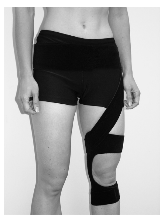
Fig. 4. Femoral strapping (Power Strap, Don Joy Orthopaedics Inc, Carlsbad, CA, USA) can be used to improve lower extremity control and kinematics during the rehabilitation program and functional activities. ( Reproduced from Powers CM, Souza RB, Fulkerson JP. Patellofemoral joint. In: Magee DJ, Zachazewski JE, Quillen WS, editors. Pathology and intervention in musculoskeletal rehabilitation. St. Louis (MO): Saunders Elsevier; 2008. p. 632; with permission.)