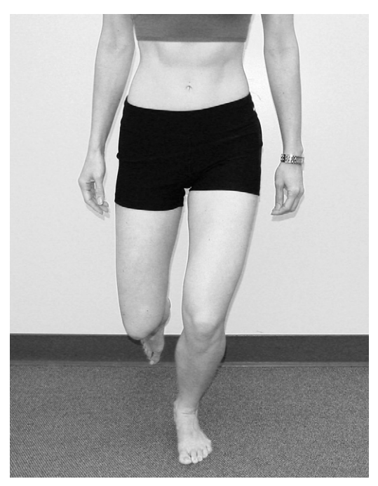
Fig. 3. Weight-bearing activities (such as the single-leg squat shown in the figure) should be done with particular attention to proper alignment of the pelvis, hip, knee, and ankle.

As strength, control, and balance progress, single-leg activities may be initiated. This is the final step before returning to full unrestricted activity. Considering that most patients are conditioned by their preoperative apprehension caused by patellar instability and that some patients may not have performed single-leg squats on the operated leg for years before the operation, the patient may not progress to this stage before 5 to 6 months after the reconstruction. In any case, rehabilitation from this point onward requires careful assessment and progressive development of proximal lower limb control.